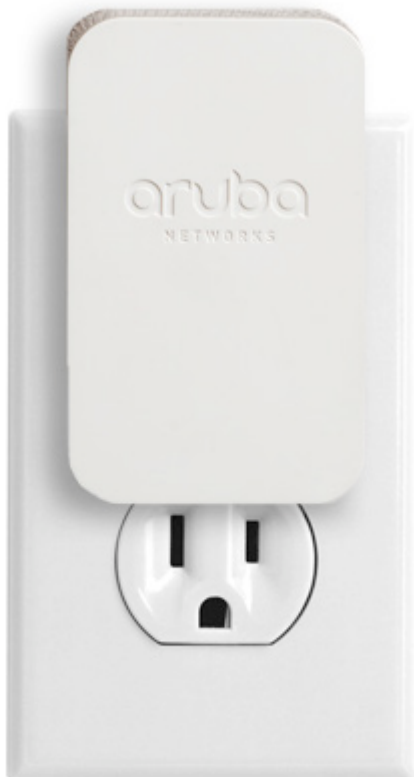
AS-100 wireless sensor

The Aruba Sensor is a small, dual-band 802.11n client radio and a BLE radio that can act as an additional Aruba Beacon to power mobile engagement applications without battery power. Aruba Sensor also allows all enterprises — whether they are Aruba Wi-Fi customers or not — to remotely manage their Aruba Beacon deployments over their existing Wi-Fi infrastructure.